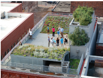
ASLA Headquarters - Washington, DC.