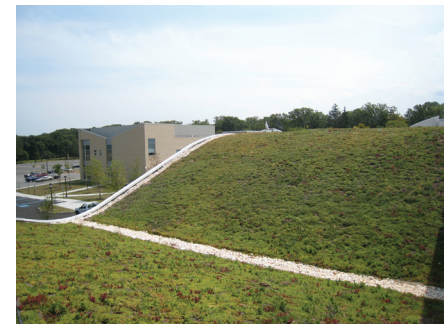
Georgian Court University - Lakewood, NJ.

Technical service is provided by Hydrotech's Technical Services and Garden Roof Departments. Every GardNet application must be reviewed by American Hydrotech, Inc. prior to any material order or installation.