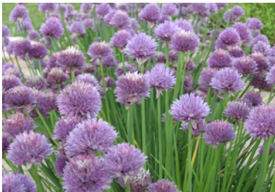
Allium schoenoprasum Chives upright perennial