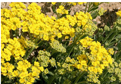
Alyssum montanum Mountain Gold spreading perennial