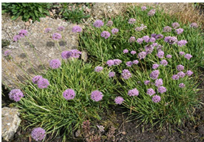
Allium senescens Ornamental Onion upright perennial