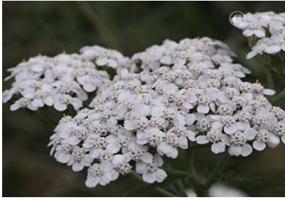
Achillea millefolium Common Yarrow upright perennial