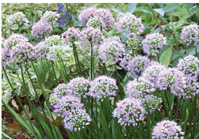
Allium senescens 'Glaucum' White Ornamental Onion upright perennial