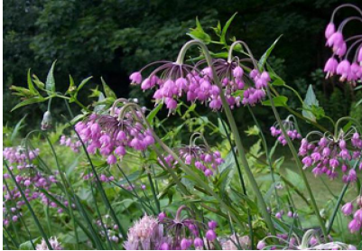
Allium cernuum Nodding Onion upright perennial